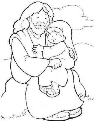
Jesus said, "Let the children come to me."

Valentines are fun to make, fun to make, fun to make. Valentines are fun to make, Let's all make one! First, we'll cut a paper heart, paper heart, paper heart. First we'll cut a paper heart, snip, snip, snip, snip! Next, we'll paint a happy face.....brush, brush, brush, brush. Now we'll glue on pretty lace.....dab, dab, dab, dab. We'll wait for our hearts to dry.....ticktock, ticktock. Then we'll hang them on the wall....aren't they lovely? (Tune: London Bridge)